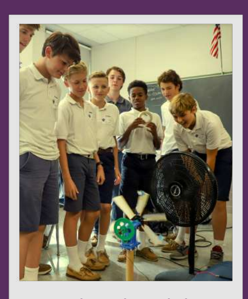
For 6th & 7th grade boys

Wednesday, April 2, 6-8 p.m. Ryken Hall Cafeteria